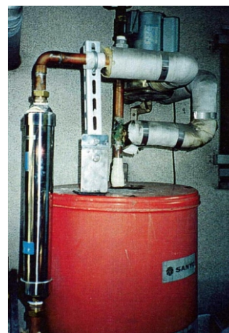
Installed at hot water supply ST - 65